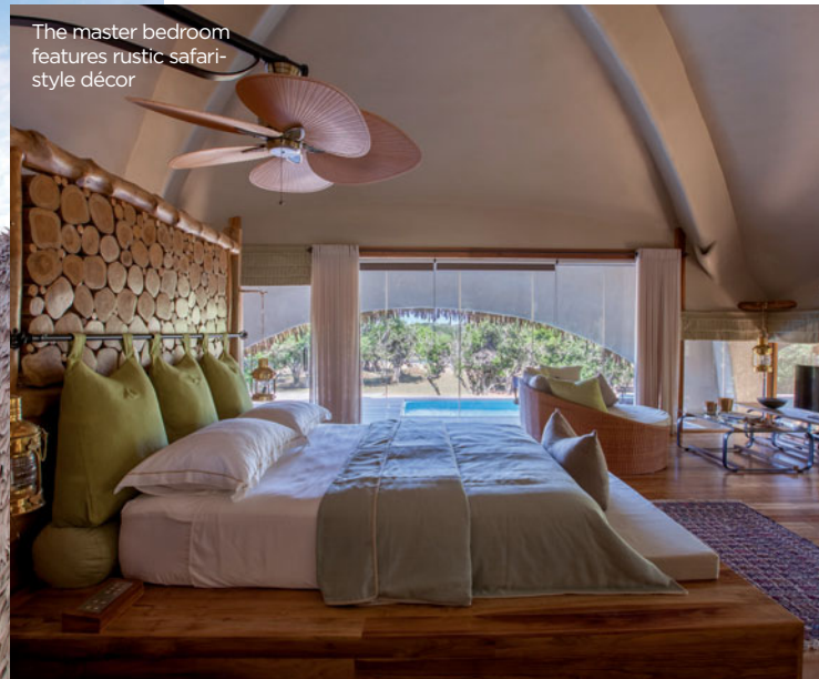
The master bedroom features rustic safari-style décor