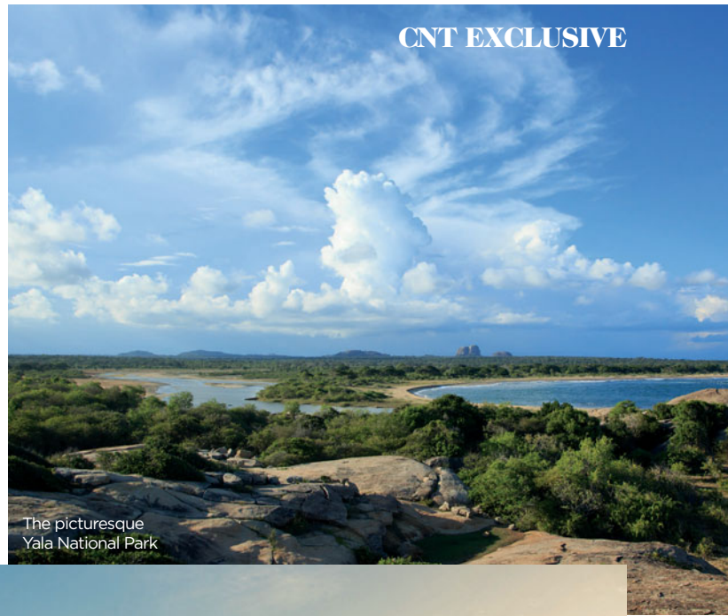
The picturesque Yala National Park