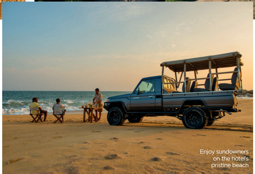
Enjoy sundowners on the hotel's pristine beach