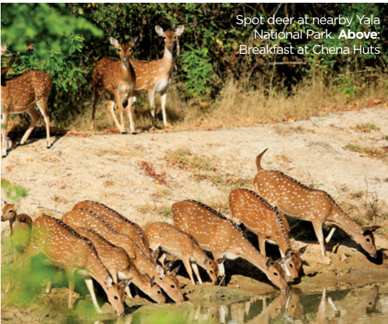
Spot deer at nearby Yala National Park. Above: Breakfast at Chena Huts